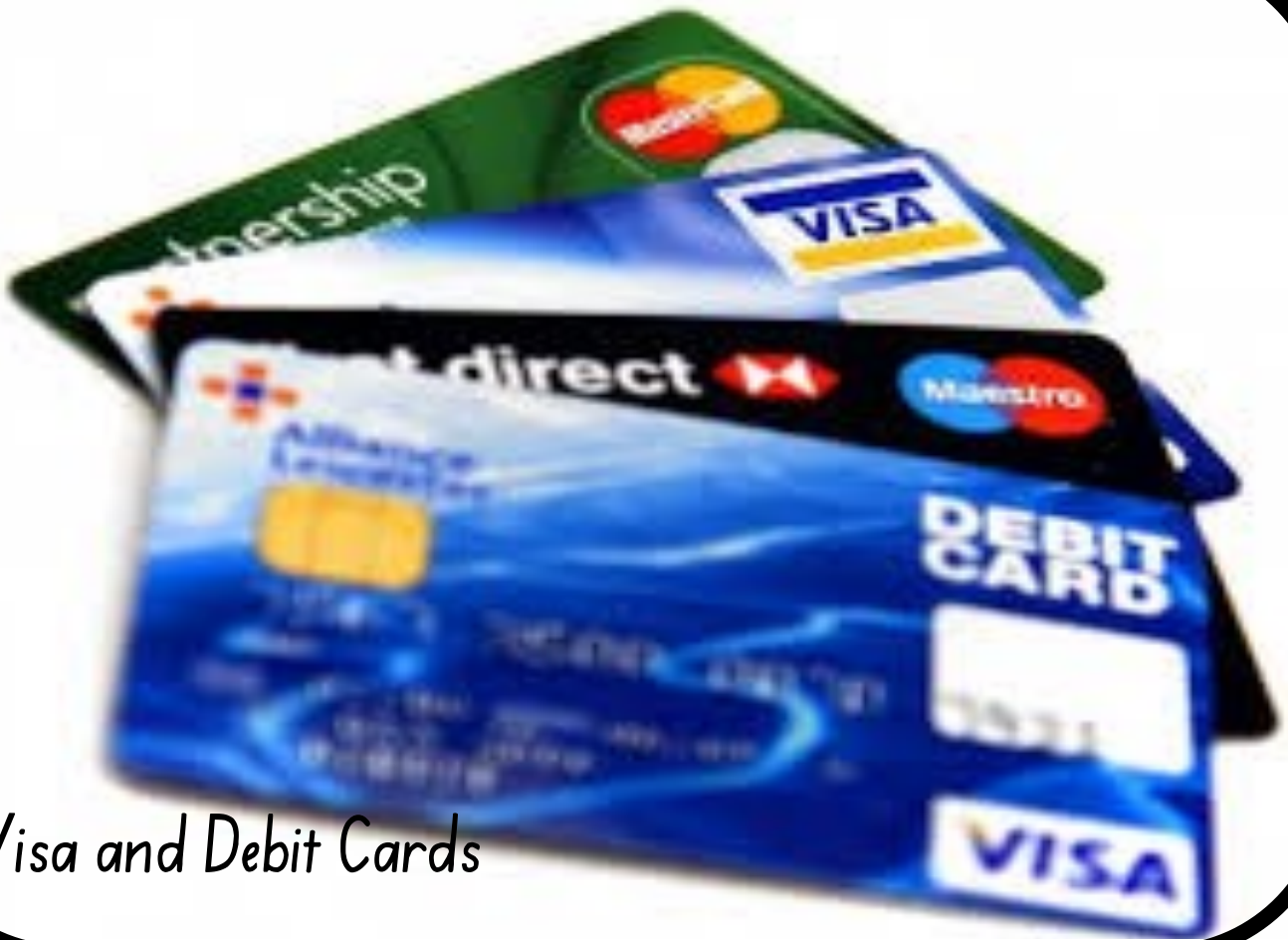
Visa and Debit Cards